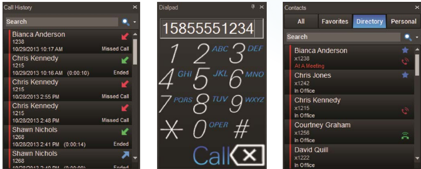
Allworx Interact Professional windows (clockwise from top left): Call History, Dialpad, Contacts, Parked Calls and Current Calls.

From information to control, Interact Professional has what you need to make your Allworx phone work for you.