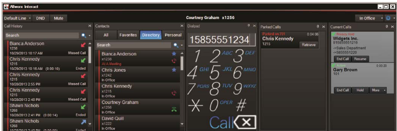
Allworx Interact Professional main screen with all windows docked. Each window can be moved out of the Interact screen and pinned wherever you like for use when other applications are active.

Allworx Interact Professional , a per user licensed application, enhances productivity by enabling users with total control of their handset. Convenient access to call history and a complete list of contacts from the Allworx directory empowers users with information and control to give them a competitive edge and better serve their customers. Microsoft Outlook contacts are also incorporated into the Interact Professional database, allowing rapid lookup and one click dialing. The ability to easily search contact lists, including both the Allworx directory and the user's personal contacts, makes placing calls much faster and more reliable.