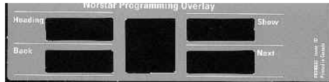
(M7310 & M7324 Overlay)