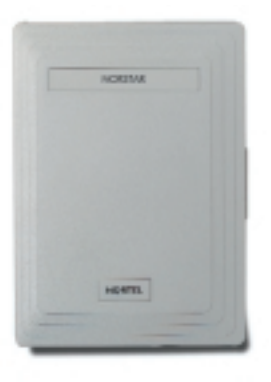
Figure 1: Norstar Integrated Communications Systems offer practical solutions. Models from left to right are the Norstar Compact ICS, Norstar 3x8 and the Norstar Modular ICS.